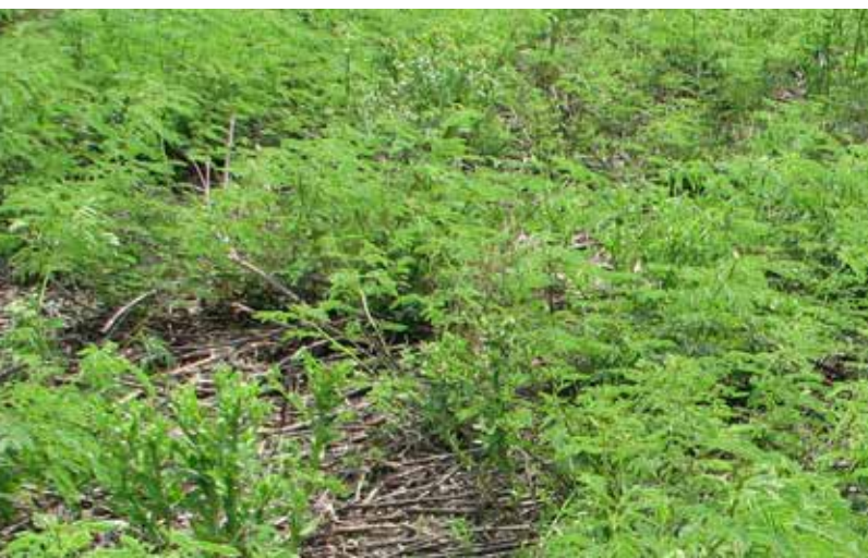
BeeWild™ Bundleflower Blend